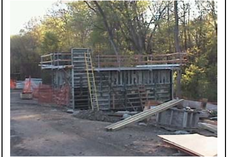
The Pedestrian Bridge over US 1 will safely join both sides of the D&R Canal. It will open in 2004.