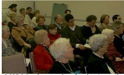
LHS Members gather for the Annual meeting each February.