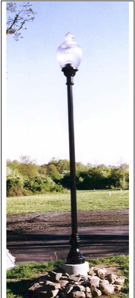
This new lap post illuminates the parking area behind the Brearley House. It was installed by the Lawrence Township Public Works Department.